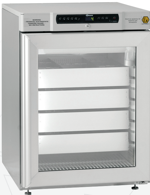
BioCompact II RR210. Drawers and glass door are optional extras.

The BioCompact II 210 is an under-counter refrigerator or freezer cabinet with a small footprint, designed for a wide range of biostorage purposes where the prime focus is on dependability and exceptional performance.