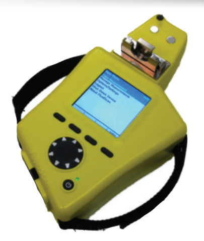
Figure 1: FluidScan handheld fluid condition monitor.