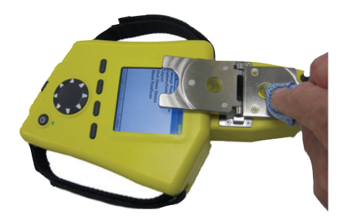
Figure 2: Patented flip top cell eliminates the need for solvents to clean.

The FluidScan monitor is a self-contained handheld analyzer that delivers instant fluid condition assessment to the user. It eliminates sample preparation and time-consuming cleanup using a patented flip top sampling cell for easy and rapid on-site analysis as shown in Figure 2. At the core of the FluidScan is a patented, midinfrared spectrometer with no moving parts. The spectrometer collects the infrared light transmitted through the fluid in the flip top cell into a waveguide as illustrated in Figure 3. The waveguide then carries the light to a prism-like diffraction grating that reflects the light into a high-performance array detector which registers the infrared spectrum of the fluid. The waveguide completely contains the infrared signal, minimizing any atmospheric interference and maximizing the amount of light within the spectrometer. In this way, the FluidScan maximizes optical throughput and spectral resolution in a palm-sized device. Consequently, it provides more than adequate spectral range, resolution and signal-to-noise ratio for the rapid analysis of in-service lubricants. This unique technology has been optimized for low power consumption, enabling the production of a rugged, highly accurate miniature device that operates on Li-lon batteries for up to eight hours.