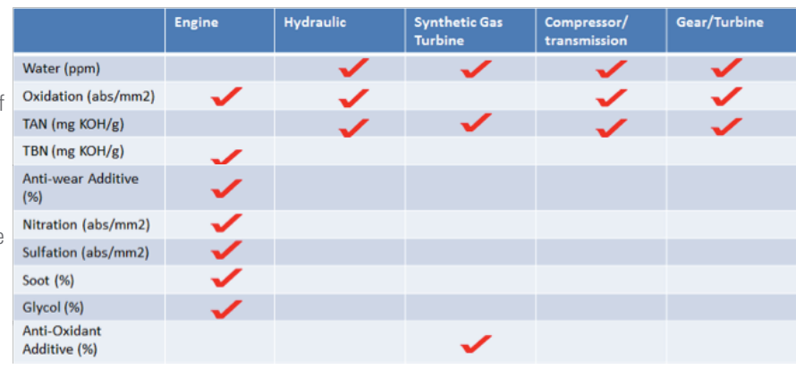
Table 2: FluidScan parameter settings by oil type

In addition to reporting quantitative values for these properties, the FluidScan provides the results in an easy to understand "go", "no go" format. This is done by using absolute warning and alarm values for each property. The report uses a simple green, yellow and red system to indicate fluid within limits, near alarm state and over alarm limits (Figure 5).